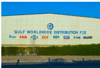
Office and Warehouse