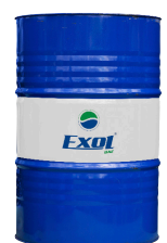
Exol Hydraulic Oil