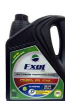
Exol Gear Oil