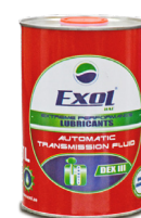
Exol Automatic Transmission Fluid