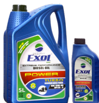
Exol Diesel Oil