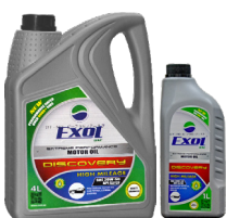
Exol Motor Oil