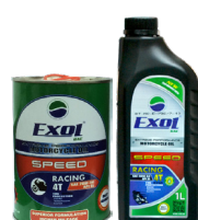
Exol Motorcycle Oil