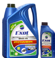
Exol Diesel Oil