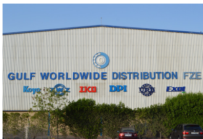
Office and Warehouse

We are currently focused in Bearings , Lubricants , Batteries , Automotive Parts for the after-market.