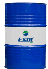
Exol Hydraulic Oil