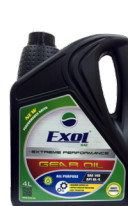
Exol Gear Oil