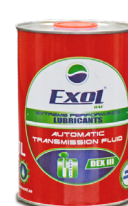
Exol Automatic Transmission Fluid