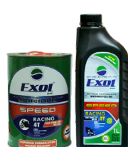
Exol Motorcycle Oil